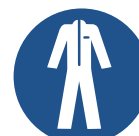
PROTECTIVE CLOTHING Use leather Chaps or suitable clothing made of a strong fabric.