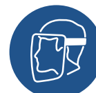
EYE & FACE PROTECTION