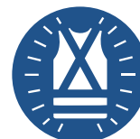
HIGH VISIBILITY CLOTHING