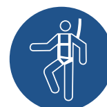
FALL ARREST HARNESS