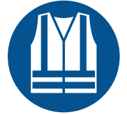
WEAR HIGH VISIBILITY CLOTHING IN MULTI-VEHICLE AREAS